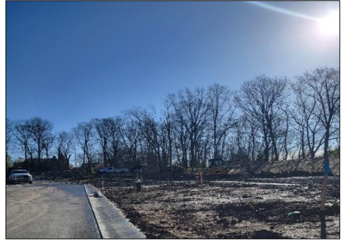
Blossom Hill Development

Here are some additional highlights from the Building and Zoning Department activities this past week: