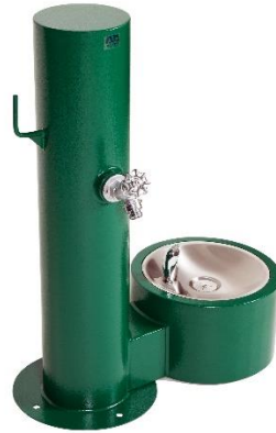
Proposed Dog Water Fountain

This week, the city submitted a preliminary request for funding through the Purina Foundation for the installation of a dog water fountain at the city's new dog park. This project was identified as a needed addition to the park (by both the dogs and their owners).